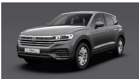
Silicon Grey Metallic