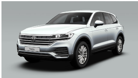
Oyster Silver Metallic