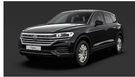
Grenadilla Black Metallic