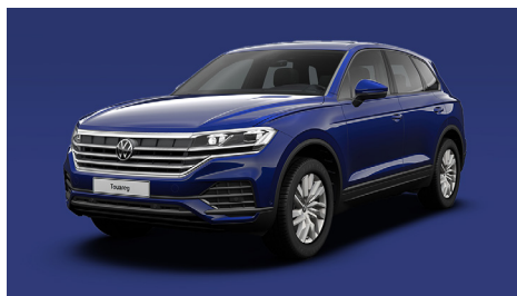
Lapiz Blue Metallic