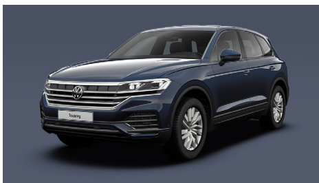
Meloe Blue with Crystal