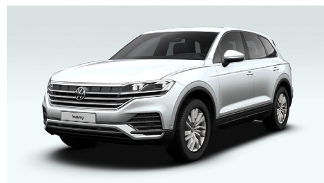
White With Mother-of-Pearl