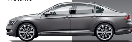
K2K2 - Pyrite Silver Metallic