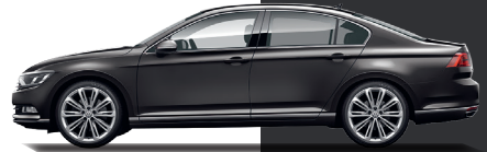
5K5K - Urano Gray