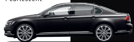
2T2T - Deep Black Pearlescent