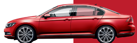
G2G2 - Tornado Red