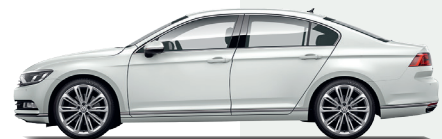
0Q0Q - Pure White